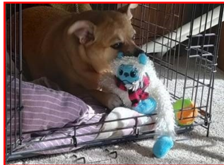
Above: One happy puppy enjoying his Christmas gift.