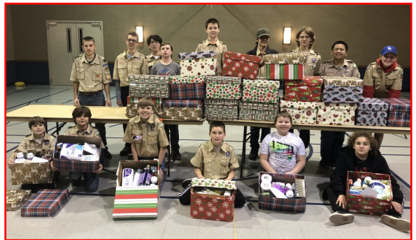
Bethel Boy Scout Troop #196 donated boxes filled with many useful items for older adults.