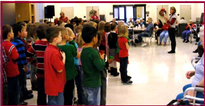
Members of the first-grade handbell choir from Summerside Elementary School perform for Welcome Center customers and staff during the holiday season. Because there is no music program at the school, the handbell choir is supervised by teacher and parent volunteers and funded by grants.