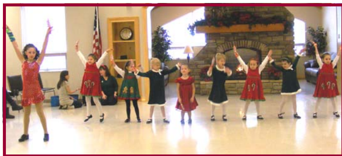
Students from Dance, Etc. in Milford presented a holiday-oriented dance program. Performers included the granddaughter of the coordinator of the agency's Caregiver Support group which meets monthly at the LBD Welcome Center.